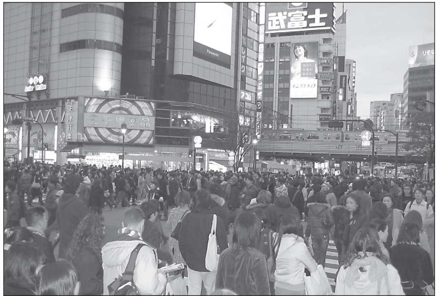
Tokyo, a major world city, is surrounded by high technology

Using educational technology for drill and practice of basic skills can be highly effective according to a large body of data and a long history of use (Kulik, 1994). Students usually learn more, and learn more rapidly, in courses that use computer